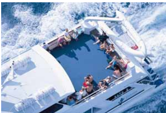
ENJOY THE RIDE

8.30am Marina Mirage (Port Douglas) Return 4.30pm