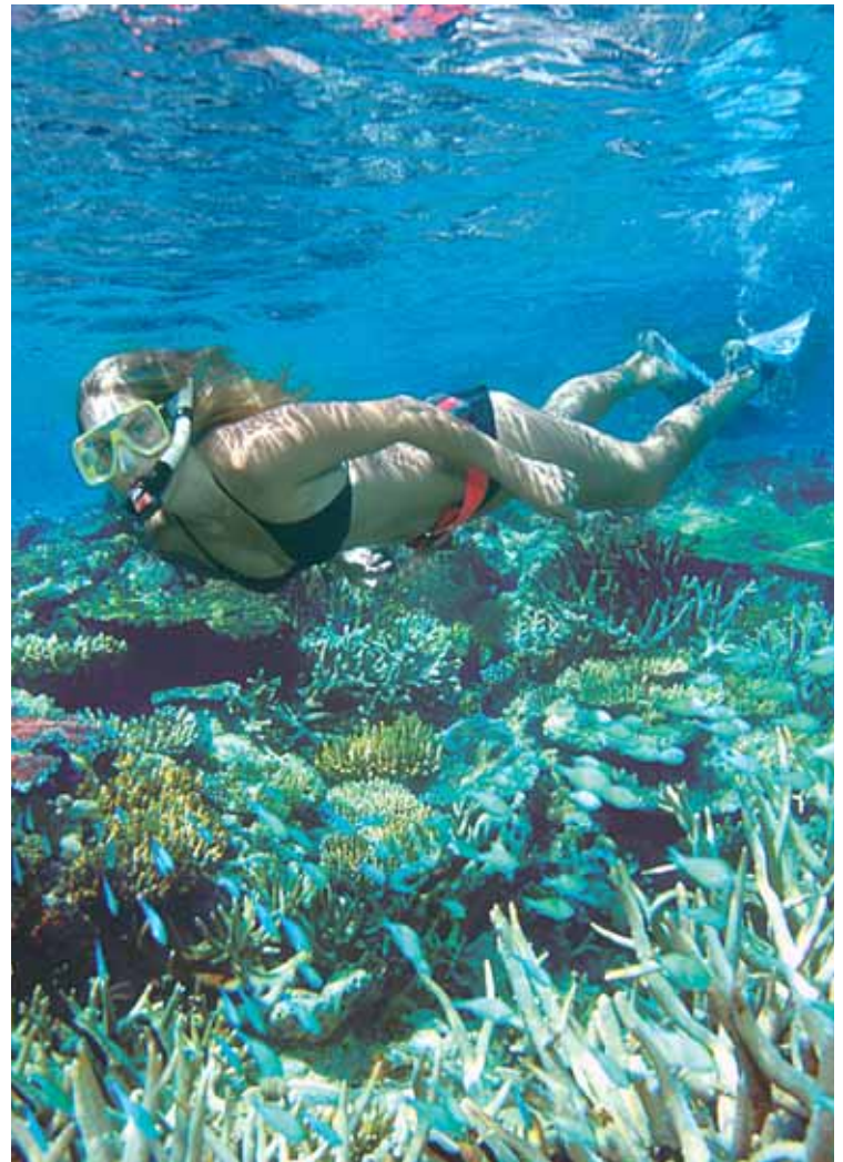
EASY SNORKELLING OVER SHALLOW CORAL GARDENS