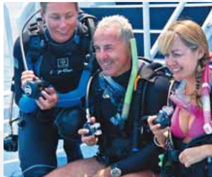
PRE-DIVE SKILLS ON PLATFORM

*Asthma and some medical conditions will prevent you from diving without a Queensland dive medical.