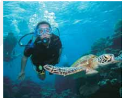
DIVE WITH YOUR INSTRUCTOR

Enjoy doing up to 3 introductory dives at 3 spectacular reef locations, or spend part of your day diving and the rest snorkelling. There is plenty of time to enjoy both activities.