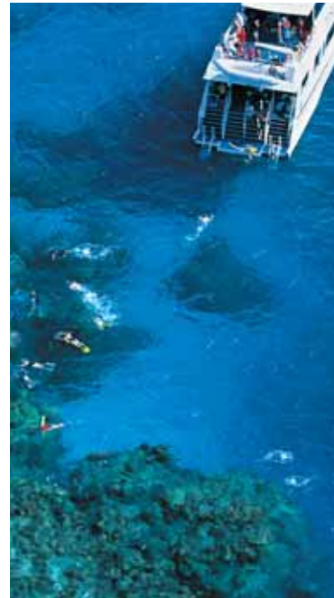
CLOSE TO THE ACTION