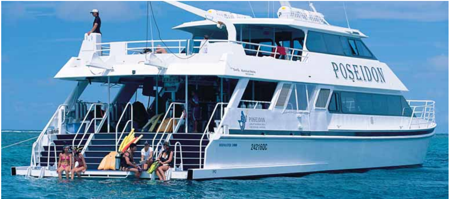
EASY ACCESS FROM SPACIOUS PLATFORM FOR SNORKELLERS AND DIVERS