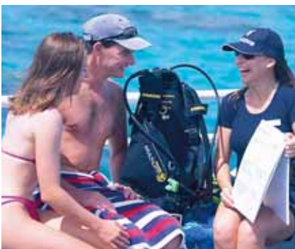
TUITION & BRIEFING ON BOARD