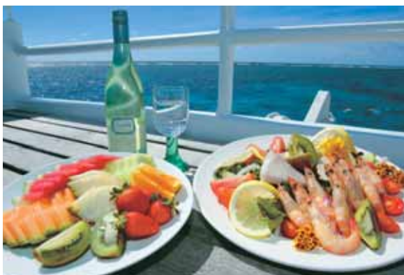
ALFRESCO DINING ON THE REEF