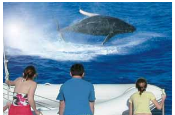
WHALE WATCHING ONBOARD POSEIDON

These friendly mammals are regularly encountered from May to September, while their larger cousins, the Hump-back Whales, appear from July to September, and are increasing in numbers.